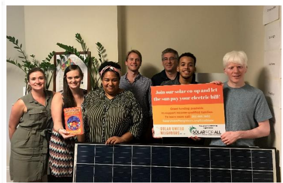
Washington, DC Solar United Neighbors team working on Solar for All program for low-income homeowners

Oregon and Portland have an opportunity in the November elections to support initiatives that are bold, visionary, and led by and for frontline communities. This webcast discussed how communities in Oregon are advancing energy democracy with initiatives such as the Portland Clean Energy Fund, which would tax corporations to finance clean energy projects that benefit low-income Portlanders, including women and communities of color.