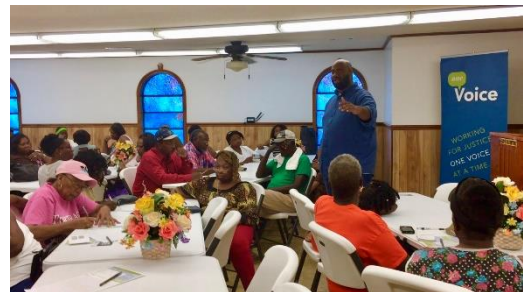
On July 21, almost 100 community members showed up at community strategy meeting in Twin County, Mississippi to take back control of their local rural electric cooperative

Close to 200 community member-owners from both the Twin and Yazoo County electric cooperatives gathered to discuss, strategize, and organize their first campaigns to elect cooperative members to their respective cooperative's board of directors. Guided by One Voice's Energy Democracy – Electric Cooperative Leadership Institute team, these community members selected candidates for board elections and planned actions for obtaining the necessary proxy votes for victory.